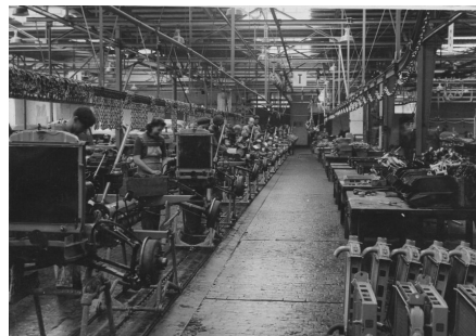
(Many thanks to Valentina for the photo – which shows early career scholars, hard at work inventing Europe, no doubt...)

academic tradition but they have on the contrary more than one fundamental role. In fact, they were asked to give proof not only of unquestionable intellectual skills but also of less obvious physical and artistic ones. There were actually different rituals to be followed in order truly to bear the title of 'ECS'. The theoretical nature of the first challenge proved especially hard for the small group: to define what an 'early career scholar' is, as opposed to a 'simple' research assistant. A few brave souls attempted some excursions to the realm of "grown-up" scholars – hoping to have a little fun with some of the "hot" issues of the workshop: the intellectual power-relation between the history of European integration, of European technology and the "transnational question", the suspect place of Eastern Europe in the global world and finally the liaisons dangereuses between the book series and the Tensions of Europe community. All too soon the "practical agenda" entered the picture...leaving the ECS wondering whether the book series' intellectual agenda could really be distinguished from its practical one (i.e. funding) and which role, research would have had in their unpredictable agenda.