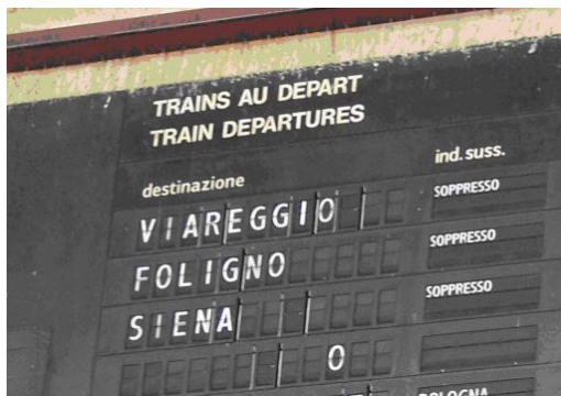
Trains = 'soppresso' Florence Station, 7 July 2008

and humidity, the apex of tension, with the order and framework of the imagined volumes being totally subverted. The ECS to the rescue again: only the ECS's artistic reflections on the tensions of the European integration could, as in the best Aristotle's cathartics, calm down hearts until the liberatory dances were finally opened and the workshop closed.