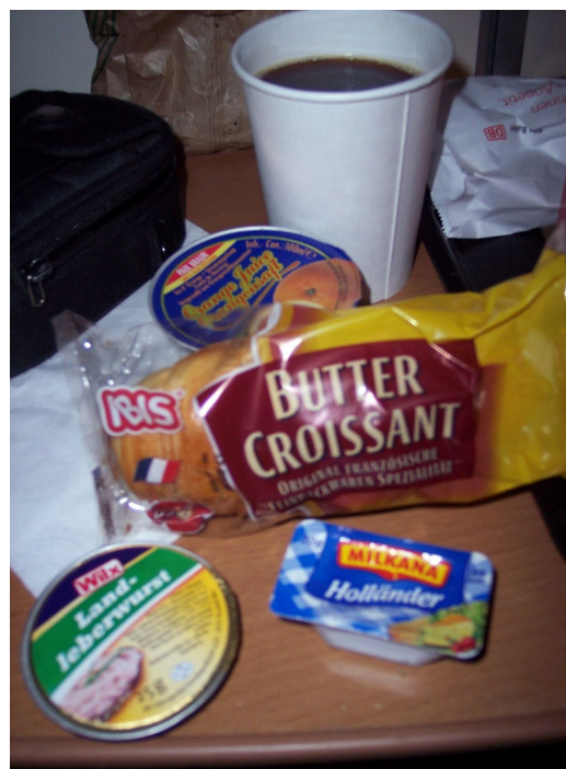
(an example of European co-operation we can improve on...)