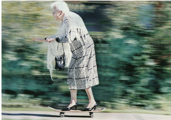
(with thanks to Dobrinka Parusheva)