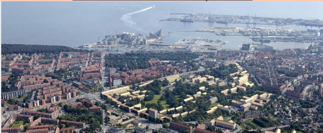
The 10th Tensions of Europe Conference